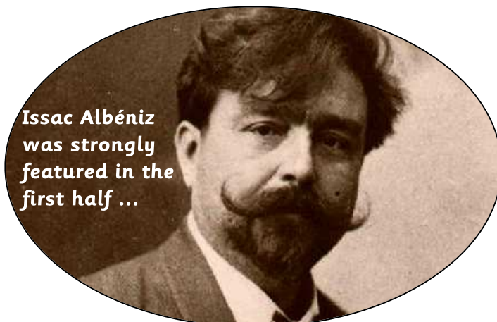
Issac Albéniz was strongly featured in the first half ...