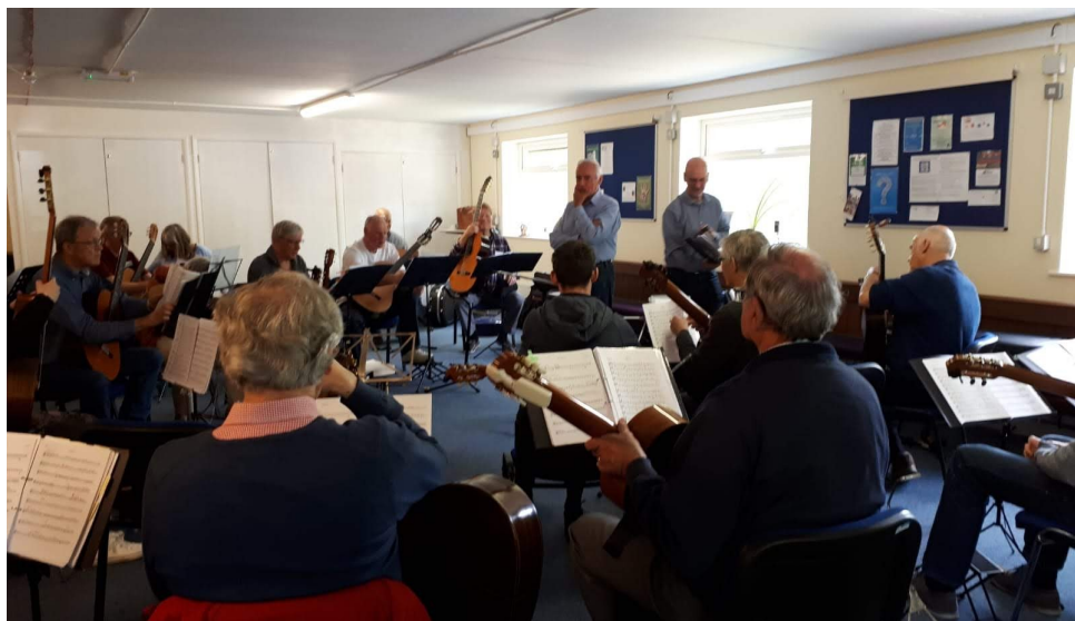
The joint WSGC & DGS Orchestra