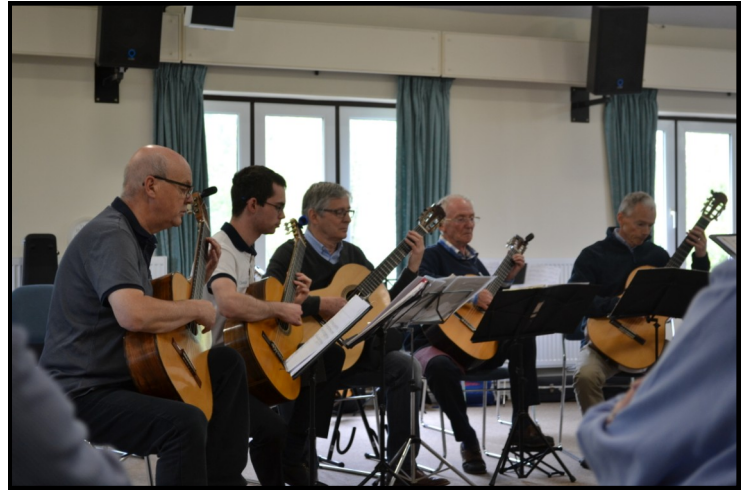
The WSGC Orchestra